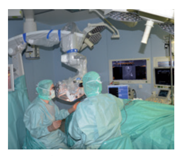
Microsurgical nerve reconstruction using intraoperative neurography and neurosonography (Multimodal Monitoring)

Intraoperative monitoring with recording of nerve action potentials (NAPs) and the high resolution neurosonography directly applied to the exposed involved nerve is particularly important in nerve injuries. With these two techniques, the surgeon can determine the best surgical technique (neurolysis, interfascicular neurolysis, split-repair or complete nerve grafting) to achieve an optimal treatment and good functional results.