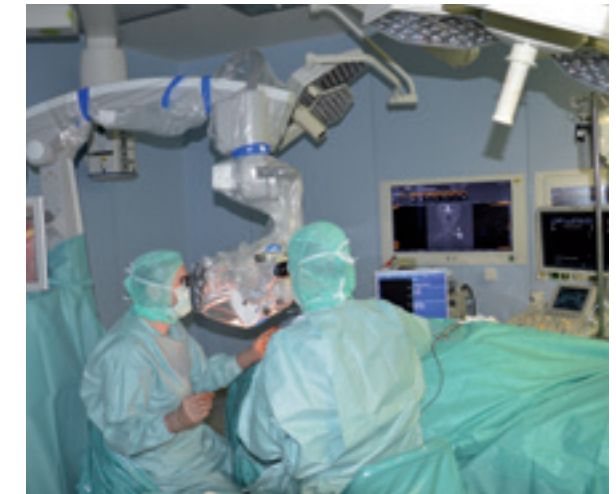
Microsurgical nerve reconstruction using intraoperative neurography and neurosonography (Multimodal Monitoring)

Intraoperative monitoring with recording of nerve action potentials (NAPs) and the high resolution neurosonography directly applied to the exposed involved nerve is particularly important in nerve injuries. With these two techniques, the surgeon can determine the best surgical technique (neurolysis, interfascicular neurolysis, split-repair or complete nerve grafting) to achieve an optimal treatment and good functional results.